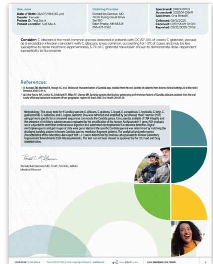
Considerations & Methodology